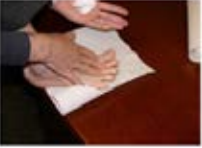
Figure D You should apply Ecoza topical foam to your toes, to the spaces between your toes, and to the surrounding areas 1 time a day for 4 weeks or as prescribed by your doctor.

Step 4: Use your finger-tips to scoop up small amounts of Ecoza topical foam and apply to the affected skin areas on your feet. Gently rub the foam into the skin. (See Figure D )